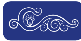
Pupuke The Overflowing Lake

The House symbol depicts a chin moko (tattoo) for Hine-ahu-one.