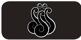
Akoranga Literal Meaning is 'Learning'

There are House points up for grabs during the year – for things such as participation during Sports Day, fundraising activities, and the level of participation by students at various school events. With prizes and pride at stake, the House system is a great way to show support, feel united and work together as a team. If you listen carefully you might just hear House chants echoing around the school.