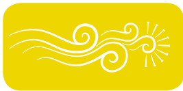
Hauraki The Northern Winds

The House symbol uses the koru to reflect the baskets of knowledge and two circles symbolise the stones.