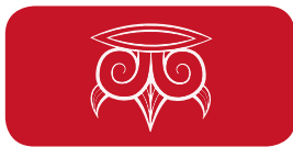
Onewa The Red Soils

The House symbol uses the koru and the spikes to represent the northern winds and the Pōhutukawa flower.