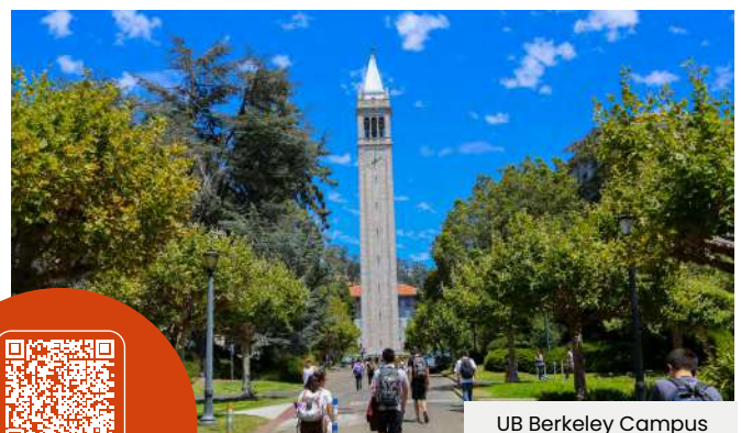
UB Berkeley Campus