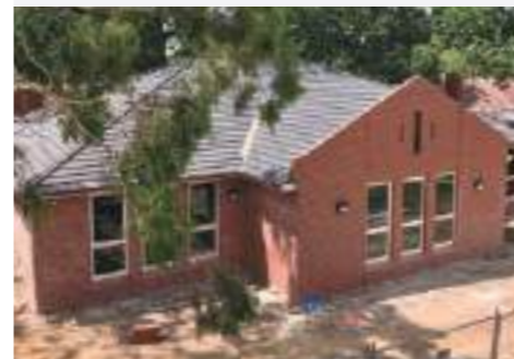
Larritt House during building works.

There has been particularly strong growth in the demand for boarding for Year 7 to 9 girls, and part of Larritt House (formerly the War Memorial Junior School) has recently been rebuilt to add capacity and improve the sense of space and light for our junior female boarders. Students in the new section