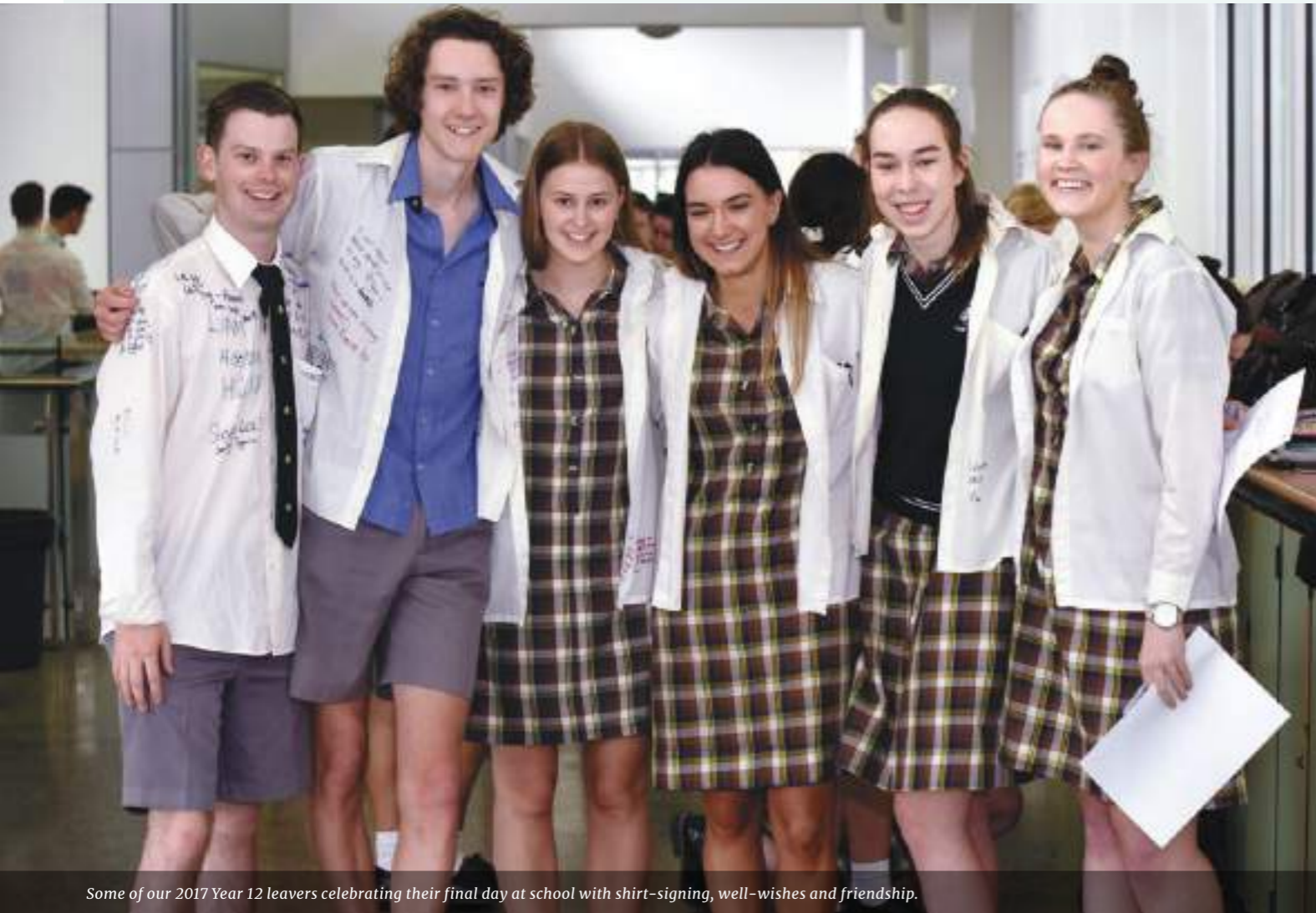
Some of our 2017 Year 12 leavers celebrating their final day at school with shirt-signing, well-wishes and friendship.