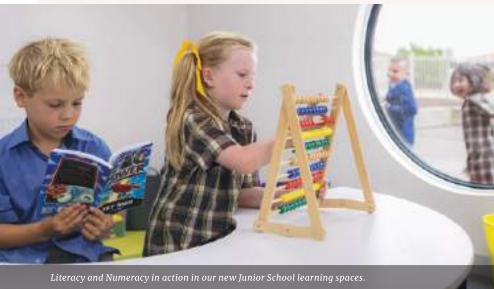
Literacy and Numeracy in action in our new Junior School learning spaces.