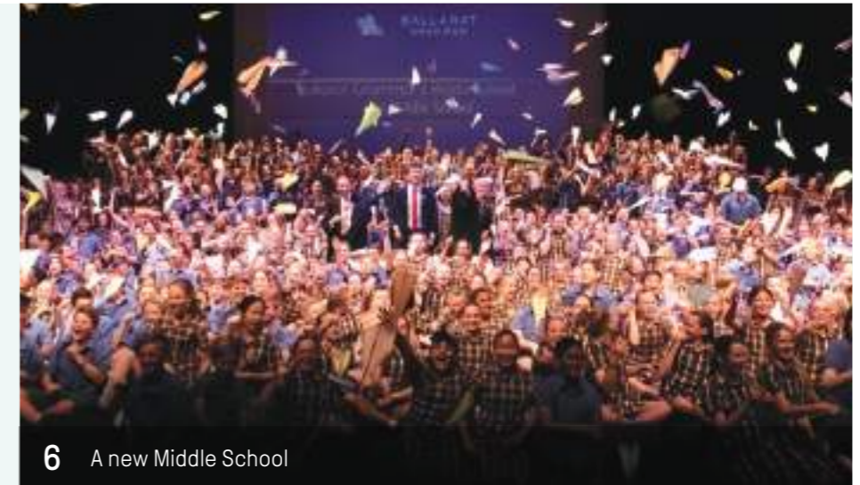
6 A new Middle School