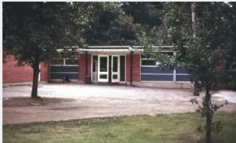
At the Boys' School, the War Memorial Junior School (also referred to as the Old Boys' Memorial Wing and the Memorial Junior Wing) was opened in 1959. It comprised two classrooms and an office block.

The wonderful new boarding facilities were completed in record time ready for the start of the 2018 school year – see more on page 21.