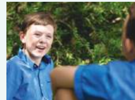
10 Leading in Wellbeing