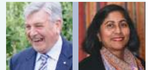
16 Meet the new Chair of the Board