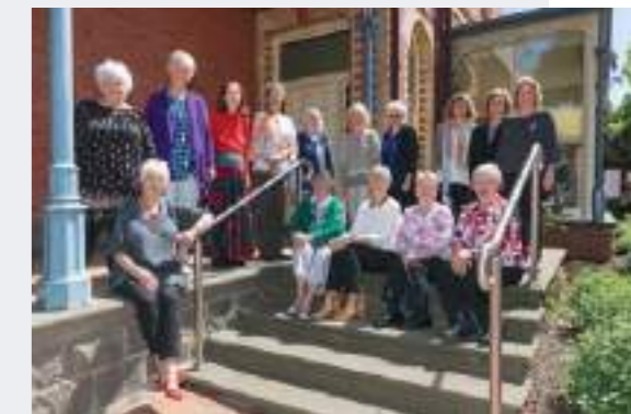
Photo taken on the steps of Manifold House: