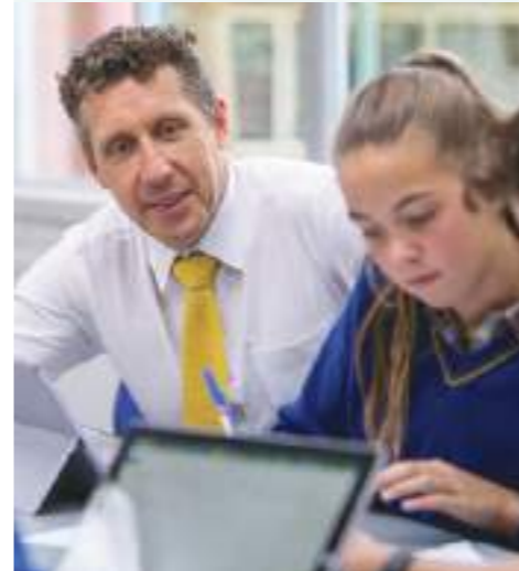
4 From the Headmaster