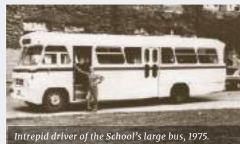
Intrepid driver of the School's large bus, 1975.