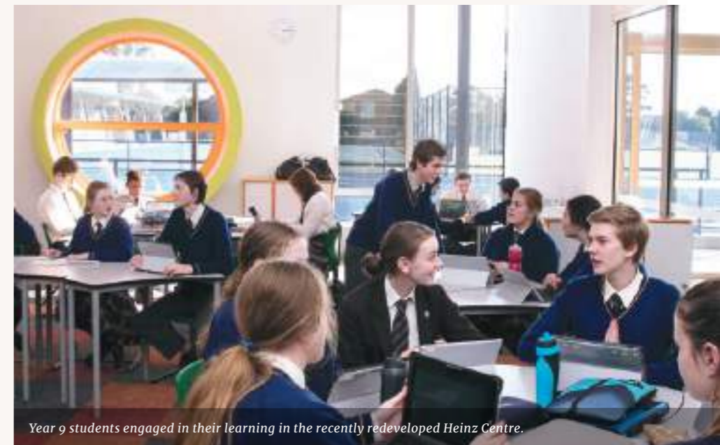
Year 9 students engaged in their learning in the recently redeveloped Heinz Centre.

I look forward to meeting all of you and building on the good work from the past to continue to create opportunities for students at the School.