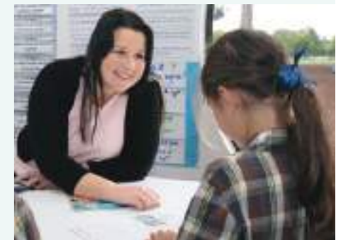
12 Literacy for the 21st Century